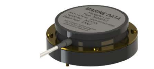
MD54 Compass Sensor Adhesive Mount (available separately) SKU F054001*