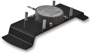
MD58 Compass Sensor Bracket Mount (available separately) SKU F058001*

*One sensor mount is a required option (available separately) - depending on the type of host magnetic compass; please contact Marine Data to obtain the correct mount